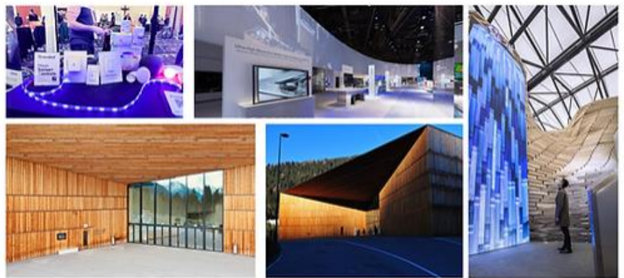
A Glimpse into Past iCANX Davos Summits: Images Sourced from iCANX

GEC has been committed to driving scientific and academic research in the ISTIME fields since our establishment in 2016. And we've developed numerous initiatives and projects, including the Global Competence Development Project and the monthly Global Top Scientists Forum, and have collaborated with renowned universities worldwide to establish global joint innovative talent cultivation centers, university-level joint research centers, and international joint laboratories.