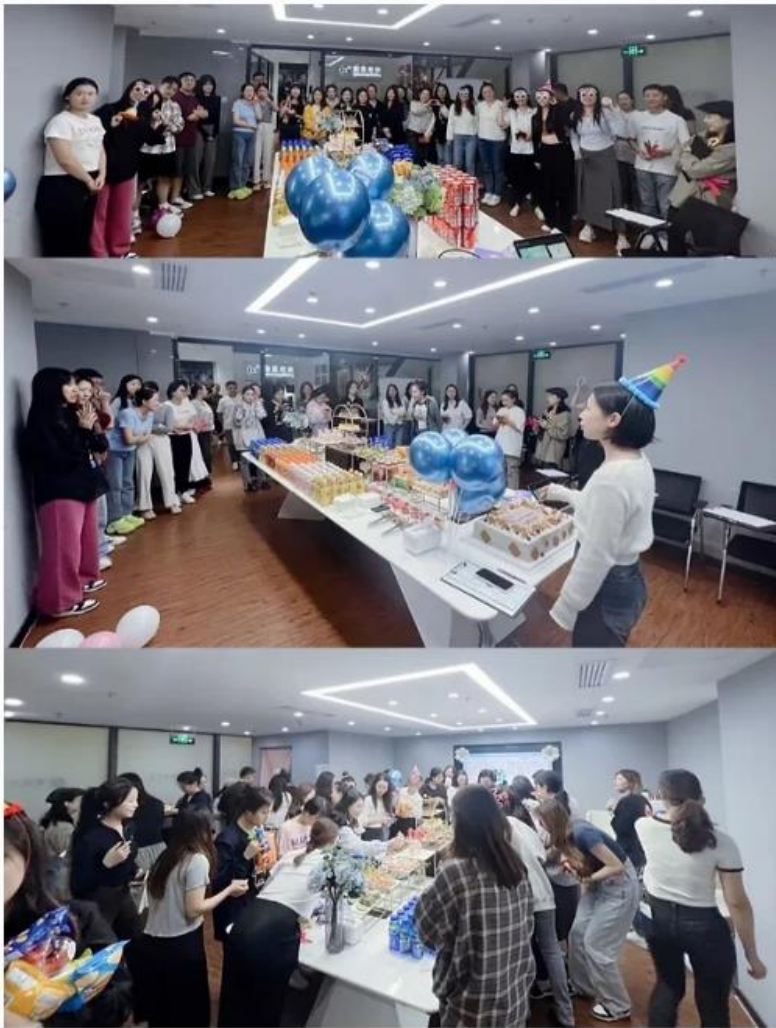
Group Photos at the First Quarter Birthday Festivity

The event culminated in a series of ingeniously devised games, such as the Draw and Guess, Shuttlecock Kicking, Pitch-pot Game, all of which captured every participant's enthusiasm. The Pitch-pot Game, especially inspired by the traditional Chinese game "Touhu", added an exceptionally thrilling element as players aimed arrows at a distant pot to score points. As part of the game, we prepared a range of delightful and lovely gifts for each participant, trying to offer a moment of relaxation and enjoyment in our hectic work lives.