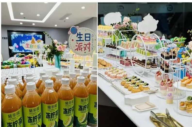
Snacks and Sweets for the Birthday Bash