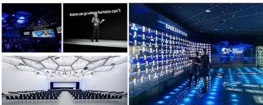
A Glimpse into Past iCANX Davos Summits: Images Sourced from iCANX

We're thrilled to share that GEC Academy will be co-hosting the iCANX Davos Summit on July 11-12th, 2024, in Davos, Switzerland. This summit is set to shine a spotlight on groundbreaking innovations and cutting-edge discoveries in Innovation, Science, Technology, Investment, Management, and Entrepreneurship (ISTIME). It will be a vibrant stage, bringing together leading academics, scientists, researchers, innovators, and civil society representatives to showcase their latest achievements, insights, and leadership in the ISTIME fields. As part of our co-hosting efforts, GEC will hold a parallel session on AI+: Frontiers, Trends and Talents Nurturing in Innovative AI Development during the summit.