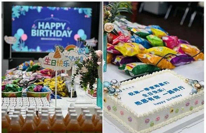
The Birthday Cake and Well-Prepared Delicacies

At this year's spring birthday celebration, we went all out to prepare this visually stunning and appetite-satisfying feast that delighted all attendees. The setting was artistically adorned with a harmonious fusion of warmth and entertainment, offering a lavish spread of delectable treats, including mouth-watering cakes, exquisite pastries, and a variety of enticing specialty snacks.