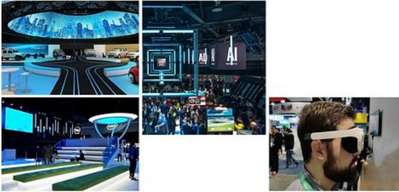
A Glimpse into Past iCANX Davos Summits: Images Sourced from iCANX